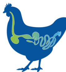
coated calcium butyrate uncoated calcium butyrate